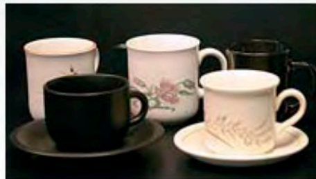
Ideal for use with china cups and mugs