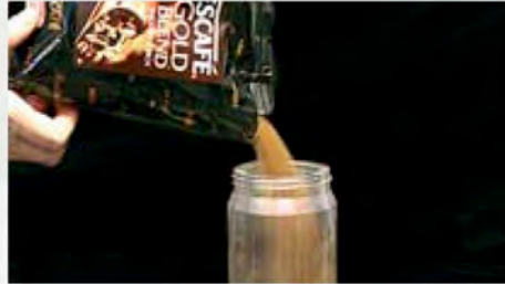
Easily refillable ingredient jars

The Olympian III by DarenthMJS is a delightful little machine from the loose ingredient dispenser range which offers excellent value for money and requires an absolute minimum of cleaning. A fantastic choice for sites which require a simple solution to their hot drinks requirement but also recognise the cost savings and convenience that only a vending solution can deliver.