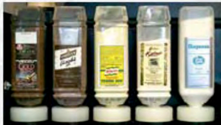
Machine fitted with pre-packed ingredient bottles (optional)